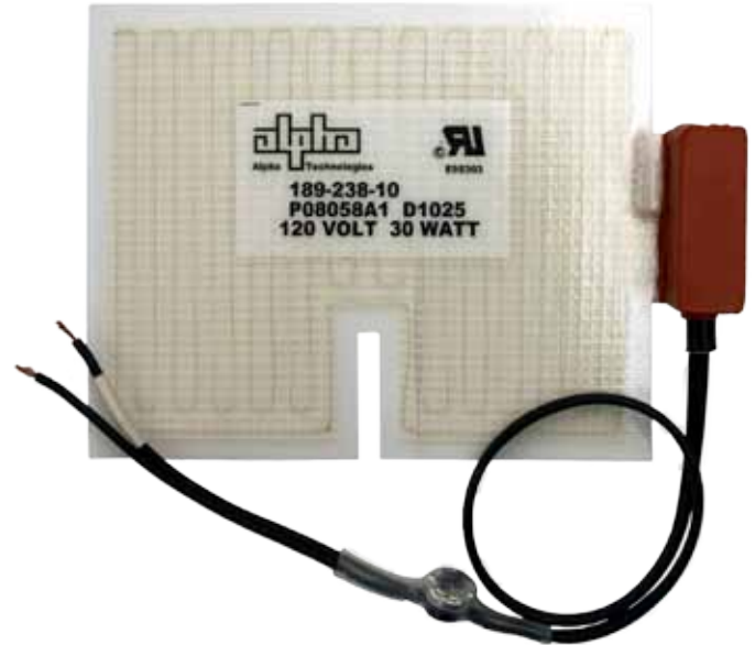
Battery Heater Pad